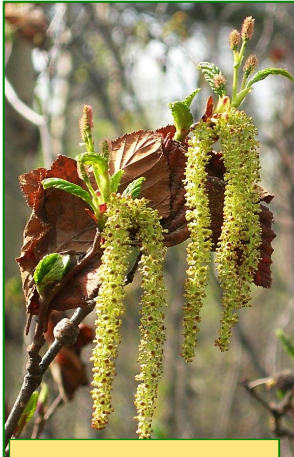
Alnus incana developing male (bottom) and female catkins (top)

systems) synergistically improved plant performance when grown on mine tailings.