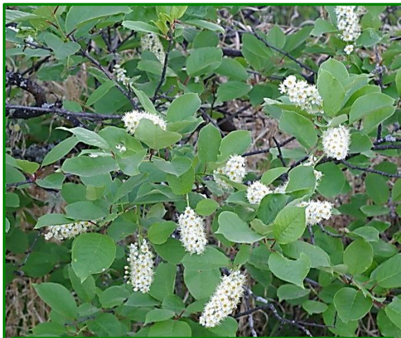
Prunus virginiana shrub in bloom