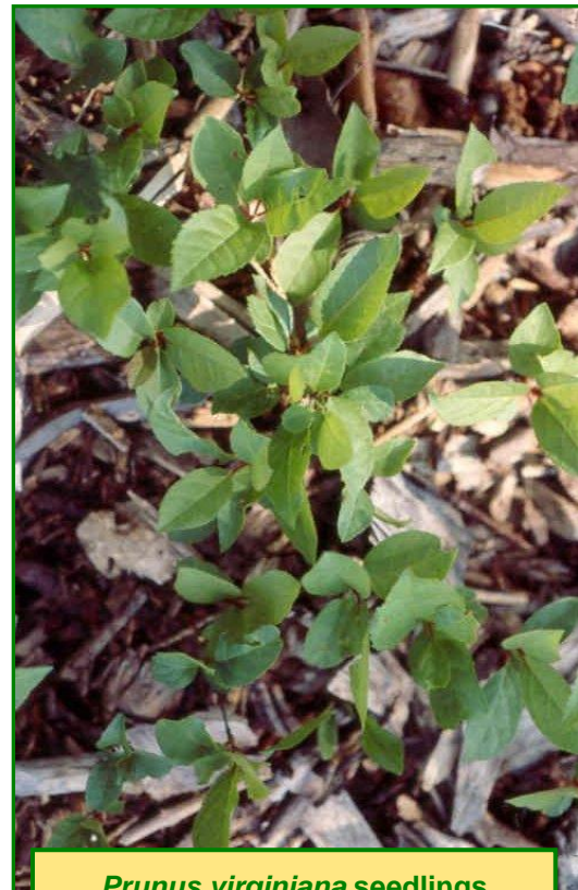
Prunus virginiana seedlings grown from berries grown on a revegetated site.

Seral Stage: Typical of a variety of stages ranging from post-disturbance (primary) to climax (Johnson 2000).