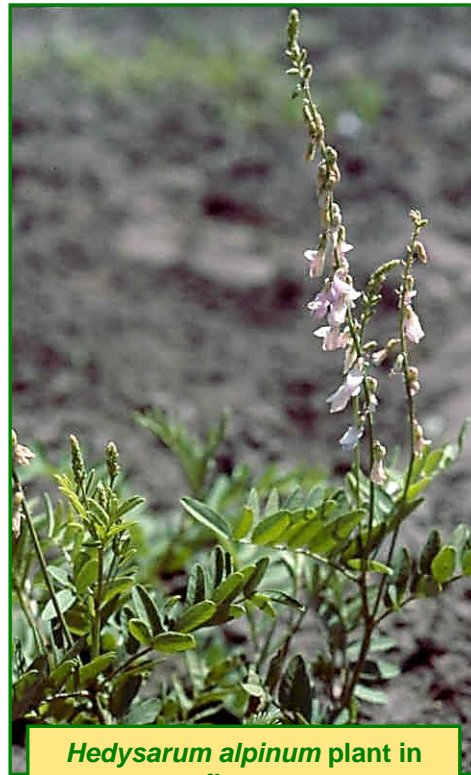
Hedysarum alpinum plant in flower

Flowering is indeterminate; they flower from late May to late September; seeds mature in the wild from mid-August to mid-September. In cultivation, seeds mature as early as late June (Pahl and Smreciu 1999).