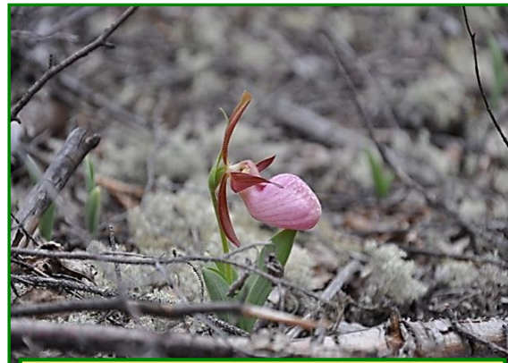
Cypripedium acaule flowering in dry woods near Fort McMurray AB.

Hand pollination results in 70% to 75% (Davis 1986) and up to 100% (O'Connell and Johnston 1998) of plants producing fruit.