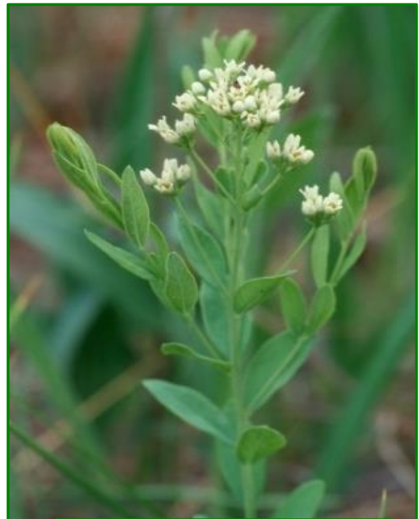
Comandra umbellata in bloom

Other: Flowers sucked by children for nectar (USDA NRCS n.d.).